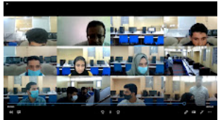
Re Assessment SOpore 28th Sep a.jpeg 175K