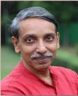
Prof. JAGADESH KUMAR Chairman, UGC