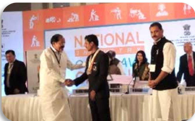
Felicitation of Winners of WorldSkills 2015 by Hon'ble Minister Shri Rajiv Pratap Rudy.