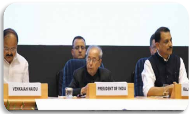
Launch of IndiaSkills on World youth skills day by Hon'ble President Pranab Mukherjee