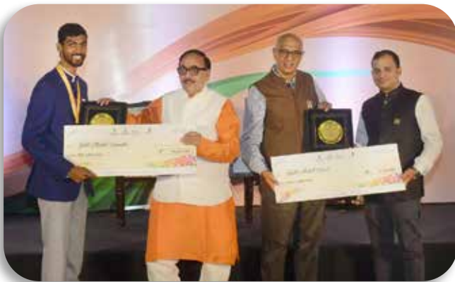
Felicitation of Winners of WorldSkills 2019 by Hon'ble Minister Shri Mahendra Nath Pandey