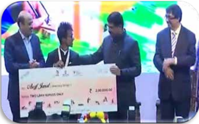
Felicitation of Winners of WorldSkills 2017 by Hon'ble Minister Shri Dharmendra Pradhan