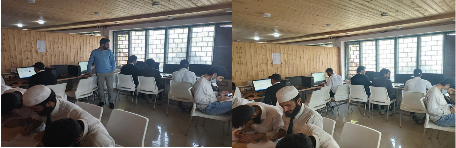
ONE DAY “INDUCTION PROGRAM FOR LIBRARY STAFF” IN SEPTEMBER-2022